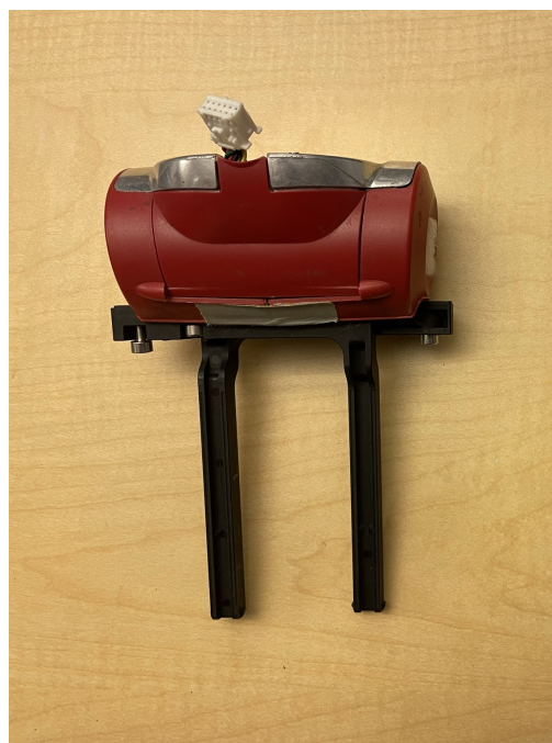
Figure 3: Electric parallel-jaw gripper.