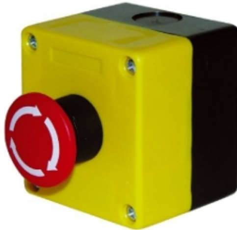
Figure 6: E-Stop button with arrows indicating how to turn the button to release it.

In any case, keep a hand on the E-Stop button whenever you are running code on the robot and don't be afraid to press it if you think a situation is or is becoming unsafe. You do not need to hold down on the E-Stop button; after pressing it, it will be mechanically held down until you release it. To release the E-Stop button from the held-down state, turn the button clockwise until it pops up. Note that the robot can only be enabled after the E-Stop button is released, and you will need to re-enable the robot before moving it again. Refer to 3.3.1 on how to enable the robot.