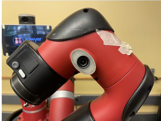
Figure 4: Sawyer wrist camera.