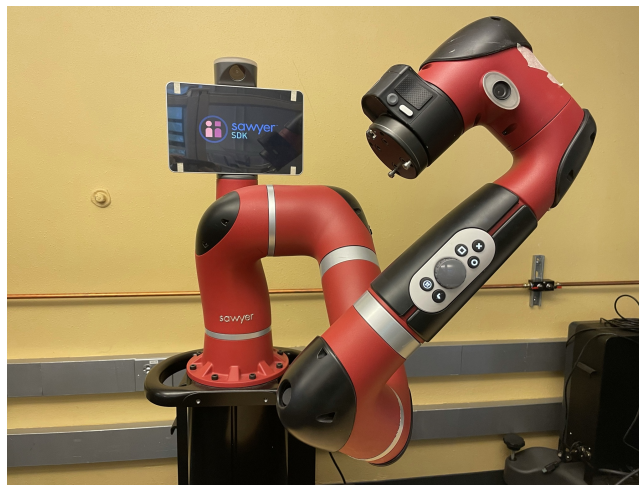
Figure 1: Sawyer robot.

In the lab, there are Sawyer robots (Ada, Alan, Amir, Azula and Alice) robots. They are from Rethink Robotics are manufacturing robots designed to operate around people. They are unfortunately no longer supported by the company, so please be especially careful when using these robots as they are difficult to fix and replace.