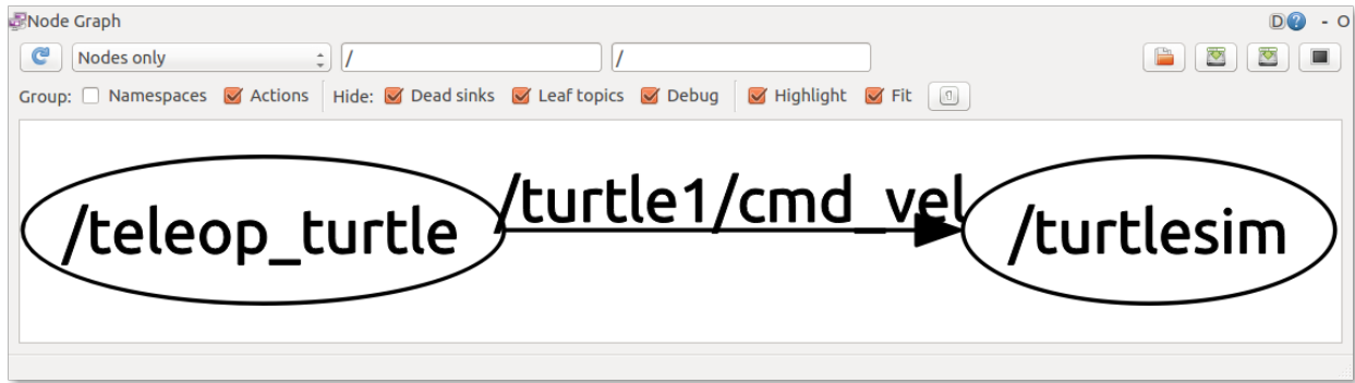
Figure 2: Output of rqt_graph when running turtlesim .

This should produce an illustration like Figure 2. In this example, the teleop_turtle node is capturing your keystrokes and publishing them as control messages on the /turtle1/cmd_vel topic. The /turtlesim node then subscribes to this same topic to receive the control messages.